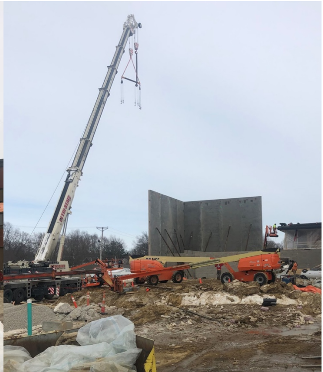
Larson works with Tri-State to stay ahead of the weather while setting the pre-cast walls.