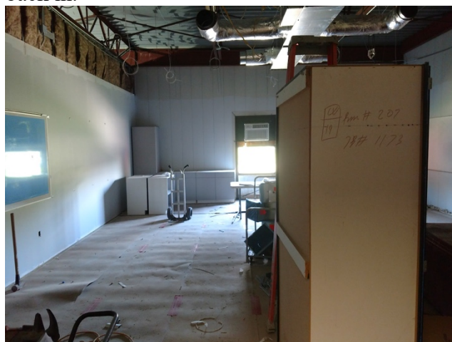
One of the middle school classrooms mid-renovation.

Currently, in the middle school hallway, Larson is finishing up casework, cabinets, doors, and hardware. Then on May 20th, they will do all the ceilings and floors. Before we know it, on the week of the 27 th , they will do punch list stuff (detail work), and teachers will be able to move back in.