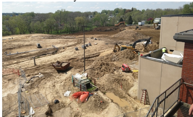
(left and above) A bird's eye view of the work on the track.

Then, it's summer, and the campus will be swarmed with construction crews for the mad dash to August when students and staff return. The construction will be over, and we will have new classrooms, an auditorium, and a track at Lisbon Community Schools.